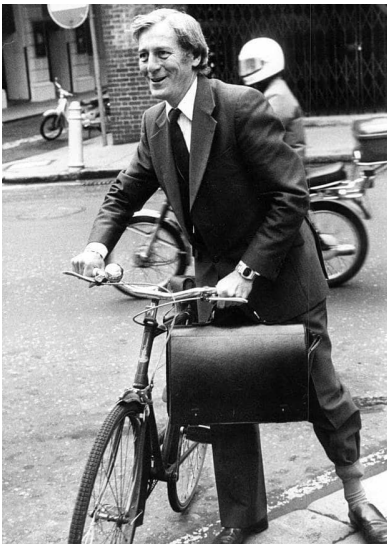
Lord Avebury in 1978 (1928- 2016)

Avebury is not going to let the matter rest. He is soliciting support from the All Party Bicycle Group and has hopes of winning a reprieve. As he says: ‘If people saw more bicycles parked among the Rolls Royces outside the Lords they’d realise this place is not full of rich idlers.’”