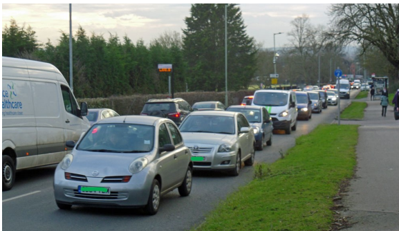
Manton Lane congestion from the school run and early exits from Manton Lane estate

The cycle network has been continually expanded since this time and currently consists of at least 156km including 71km off-road paths and tracks and 61km quiet roads. There are still some gaps including ones through the town centre, over the railway line and across several junctions.