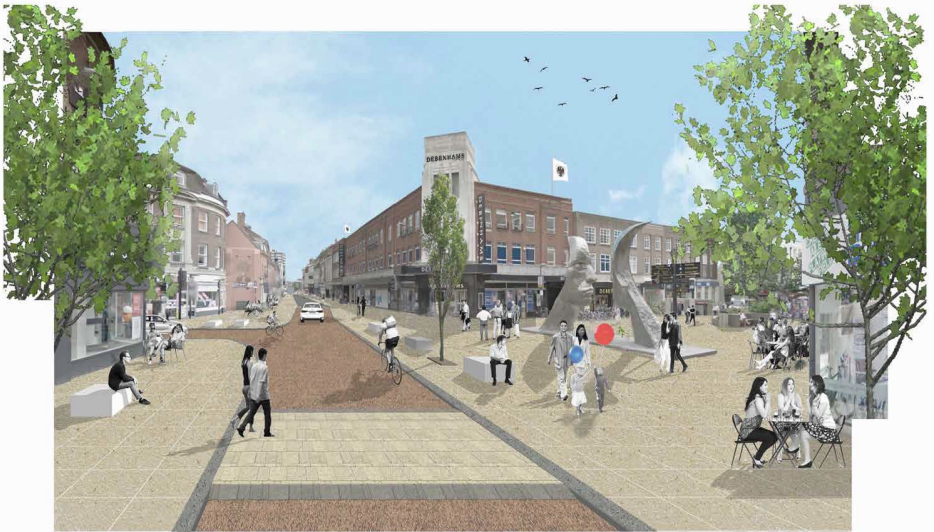
Illustrative view of enhanced public realm

The town bridge to have widened pavements by narrowing the carriageway over the bridge to enhance east-west pedestrian and cyclist connections to the riverside paths.