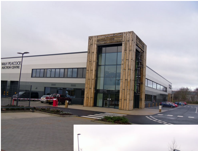
New premises in Wallis Way

The ones provided situated opposite the main entrance, although very pretty in their red colour, are 'not fit for purpose' and do not conform to Bedford Borough Council's Supplementary Planning Document (SPD) on Parking Standards for Sustainable Communities. The nine stands, due to a low crossbar connecting each one, do not allow cycles to be centralised for easy locking of both frame and wheel. Just locking the wheel is not secure and may also damage the wheel and bike if knocked. CCNB has asked for them to be modified or replaced.