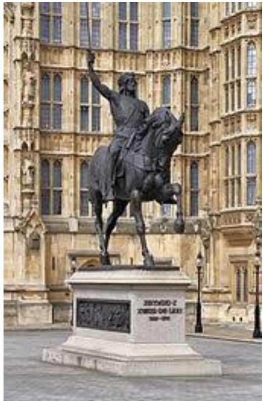
Statue of Richard I