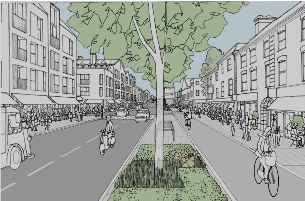
Artists impression of the west end of Midland Road

The respondents put access and congestion around the car parks and roads around the station the top of their concerns followed in the top six by the need for a better pedestrian and cycle infrastructure (including routes, signage and parking) connecting the station, town and riverside to help reduce both traffic and pollution.