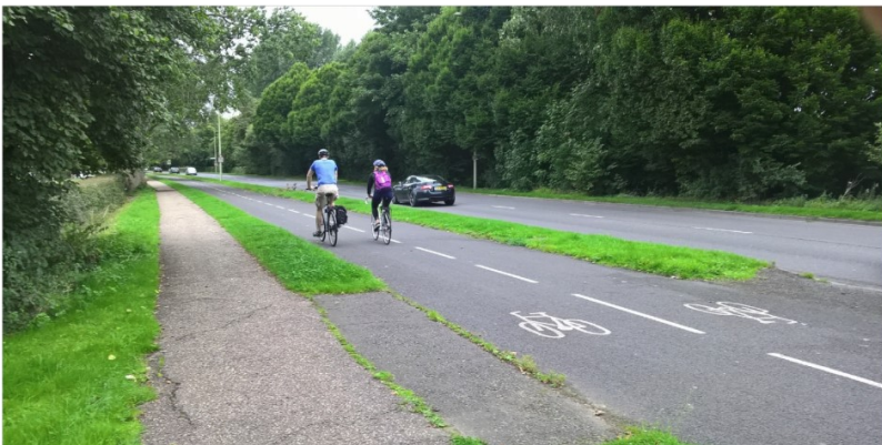
Oxfordshire cycle friendly route

The way the research was publicized was held up as a blueprint as to how things should be done. They developed a toolkit in the form of a final report, and briefing notes, which highlight the ways that policy makers, practitioners (such as engineers, designers, planners and architects) and industry can support older people's cycling through design. They also produced a suite of short documentary films which provide an illustration of how design and social practices affect cycling mobility and wellbeing among older people and the implications in terms of creating age-friendly cities.