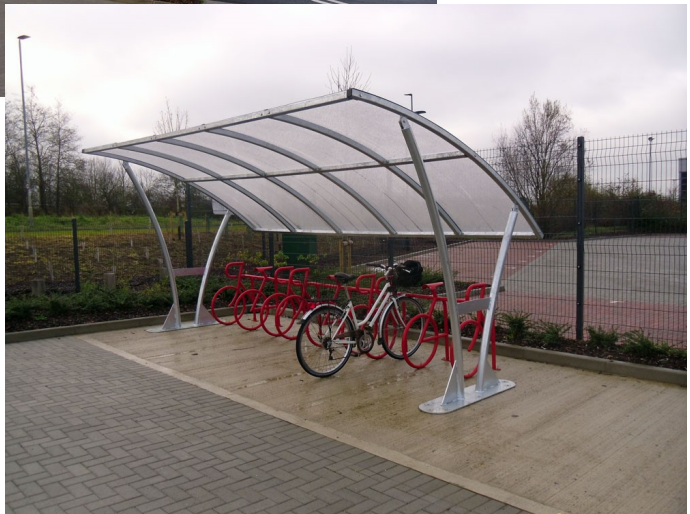
Bike styled stands 'Unfit for purpose'