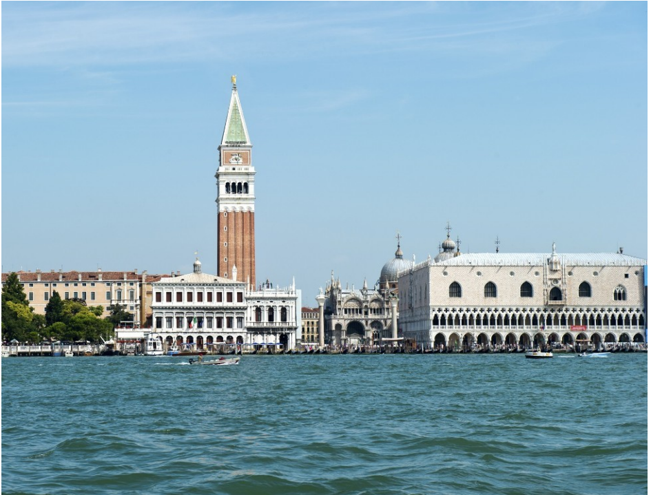
Venice's Piazza San Marco with the St Mark's Basilica

When you talk of Venice (Venezia), the capital of northern Italy's Veneto region, you immediately think of the car and bike free historic city built on more than 100 small islands separated by canals and linked by bridges in a lagoon in the Adriatic Sea.