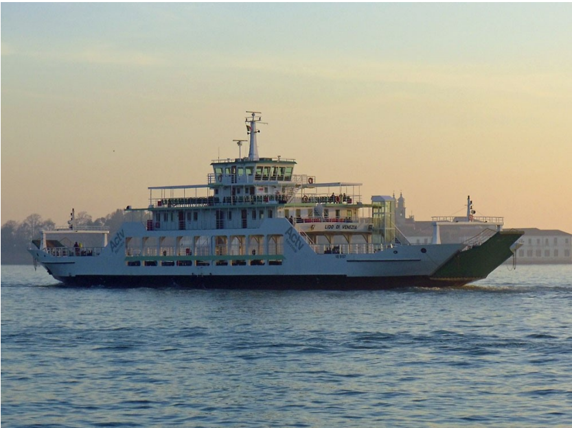
Lido to Mestre car ferry