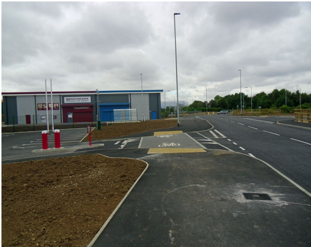
New wide track with good crossing points of entrances - Each business unit has 'Sheffield' cycle parking stands under cover

At the request of CCNB the area was mowed and the paths cleared at the end of September 2016.