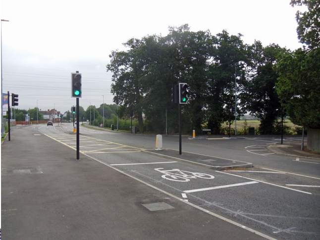
Four metre width off-road track with ASLs on-road

The junction was completed during September with a 4m wide cycle track and a new toucan crossing of Bromham Road just slightly west of the original one together with an additional toucan across the new road into the development. All sections of the carriageways which are controlled by traffic signals have Advanced Stop Lines (ASLs) for on-road cyclists.