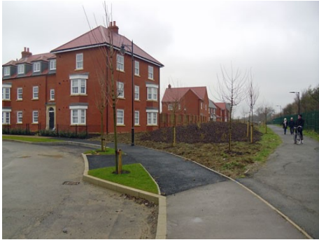
Original track alignment Not going towards dropped kerb

When the track from Ridge Road to Wilkinson Road was constructed two years ago no dropped kerb was provided. One was put in recently but separated from the track by an earth bank planted with trees. The whole section has now been dug out and renewed with the track going to the dropped kerb.