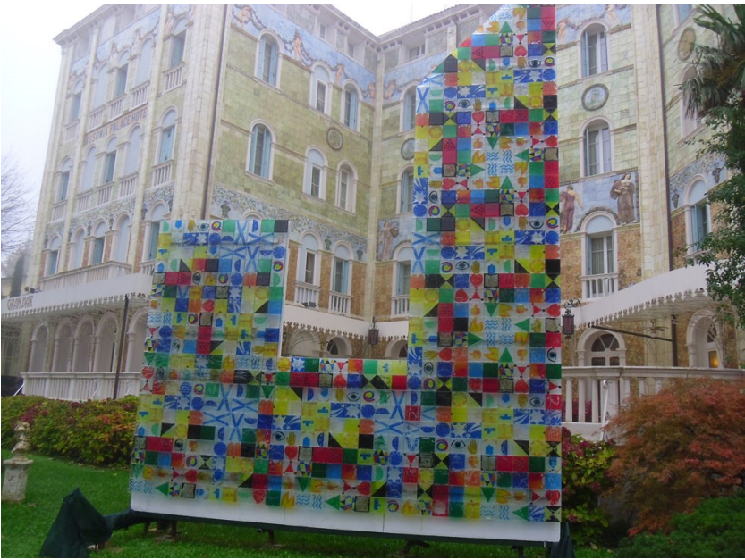
Biennale Art installation on Lido