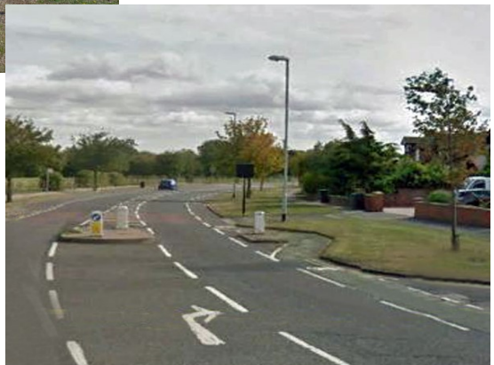
Cycle bypass 2005