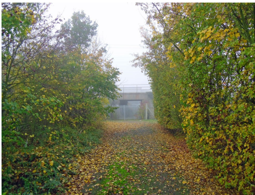
Track in Progress Park towards bridge