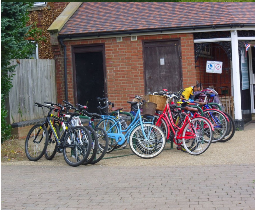
↑ New cycle stands to left of cafe just after installation