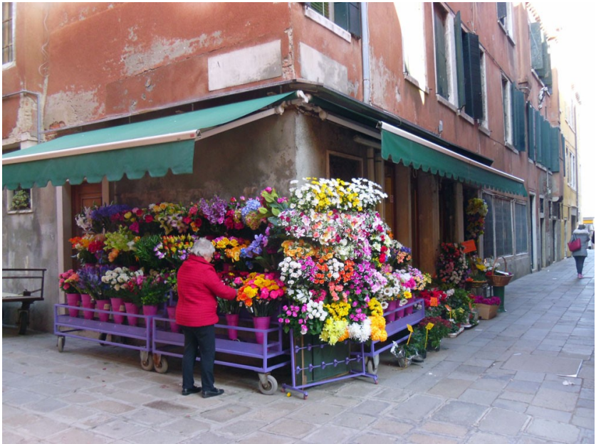
Local flower shop