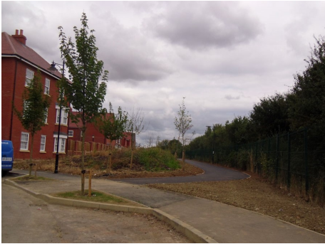
New alignment of track and dropped kerb