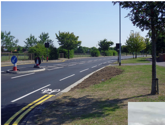
Cycle bypass removed 2016

The cycle bypass took cyclists away from the line of sight of motorists where the lane was too narrow and put them back into the carriageway at a point where motorists were prone to overrun the cycle lane.