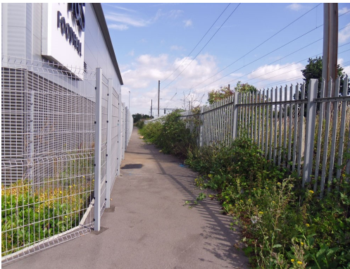
Dual use track behind M&S in Interchange Park East

CCNB has asked the Borough Council to request Network Rail to reopen the bridge to enable the link to be established.