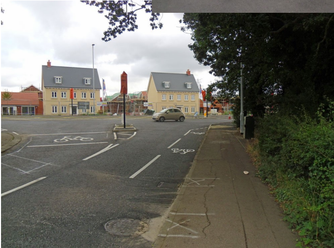
Short on-road cycle lane and off-road track at Biddenham turn