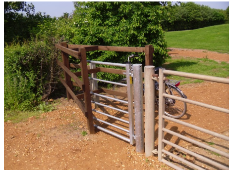
New kissing gate installed 2016