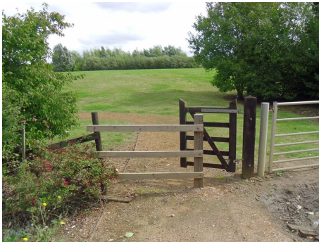
Modification of east gate 2013

CCNB is waiting for an explanation and rectification.