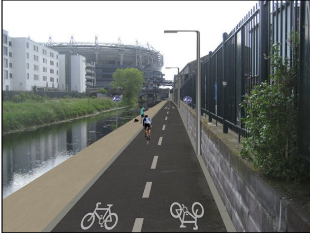
Royal Canal route looking east towards Portland Place

When finished it will be the Dublin leg of a national cycle route that leads to Galway. It will also be Ireland's contribution to the proposed east-west EuroVelo Route 2 from Galway to Russia via Britain, Germany, Poland and Belarus.