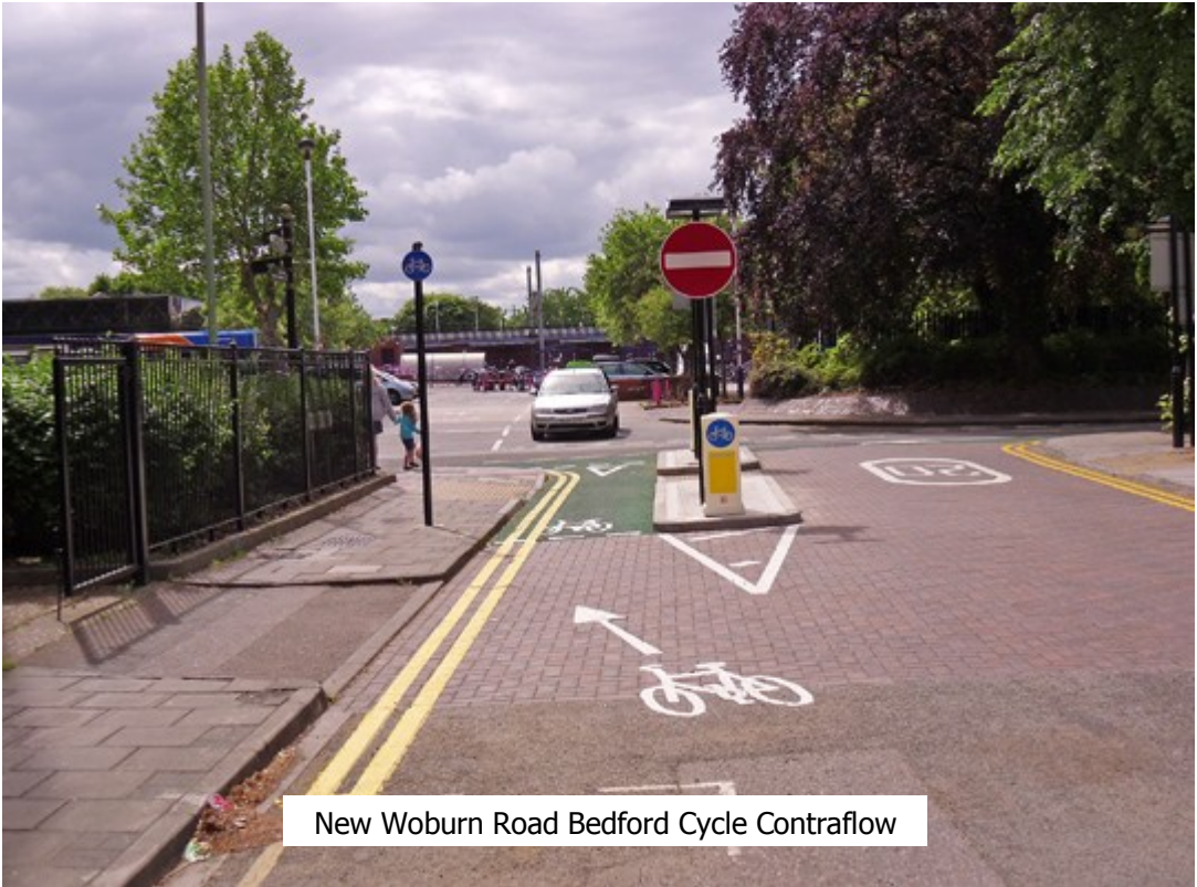
New Woburn Road Bedford Cycle Contraflow