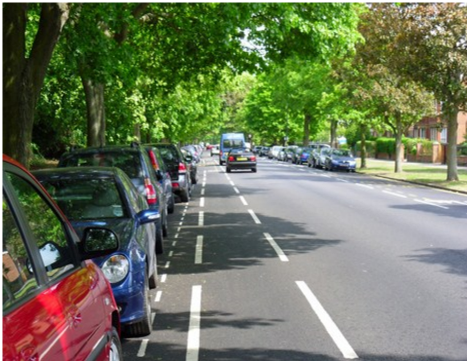
Outside lane marking is 1.5 metre from car park bay line

Where cycle lanes are on the outside of parking bays a buffer zone is usually provided. However due to road width availability it is not always possible to provide one which gives a proper safety margin for any motorist who may open their car door without due regard to the presence of approaching cyclists. To allow for this eventuality it is advised to always cycle at least one metre out from the side of any parked cars, that is, in the case of the cycle lanes in both Park Avenue and De Parys Avenue, to always cycle in the right hand half of the cycle lanes.