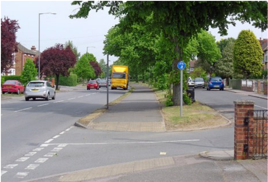
View along looking east near the set-back section of Goldington Road

At the Newnham Avenue end the cycle section has a unsatisfactory link onto the main carriageway just before the junction which could cause some concern for inexperienced cyclists. Unsure cyclists would be better to dismount and walk across the junction using the pedestrian controlled phase of the junction lights.